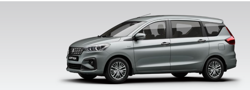
NEW Magma Gray Metallic (ZYZ)