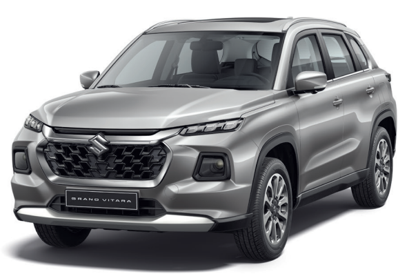
Splendid Silver Pearl Metallic