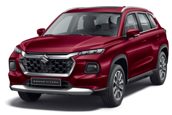
Opulent Red Pearl Metallic