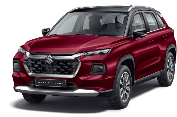
Opulent Red Pearl Metallic