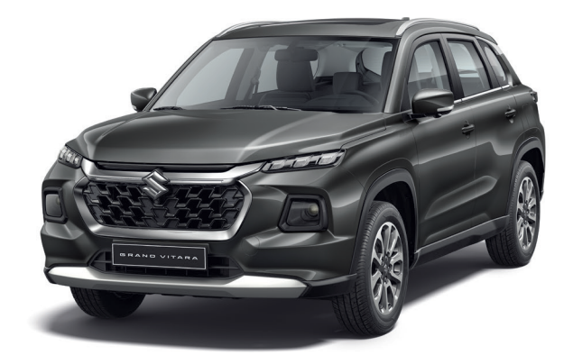
Grandeur Grey Pearl Metallic