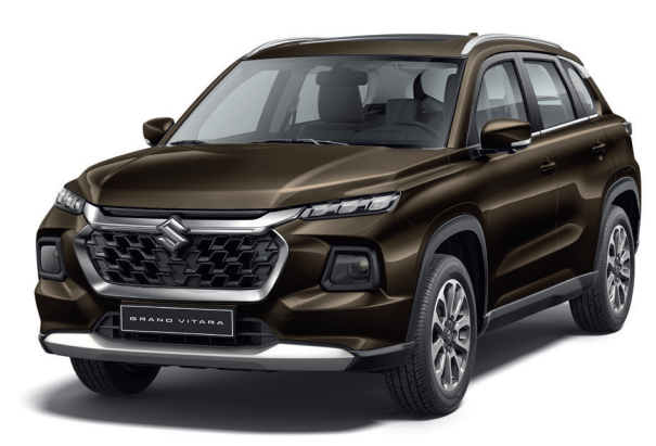
Cave Black Pearl