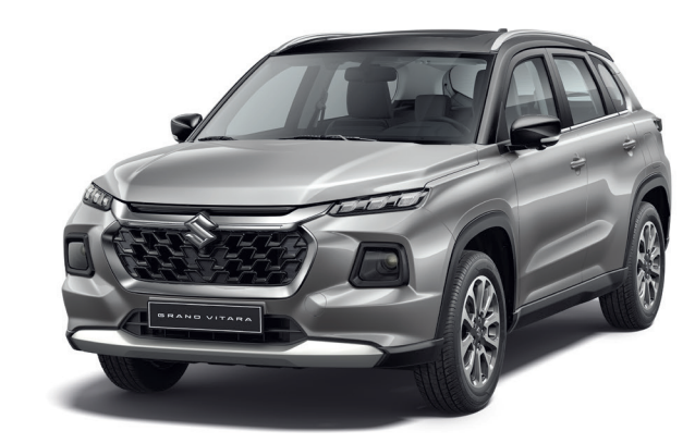
Splendid Silver Pearl Metallic